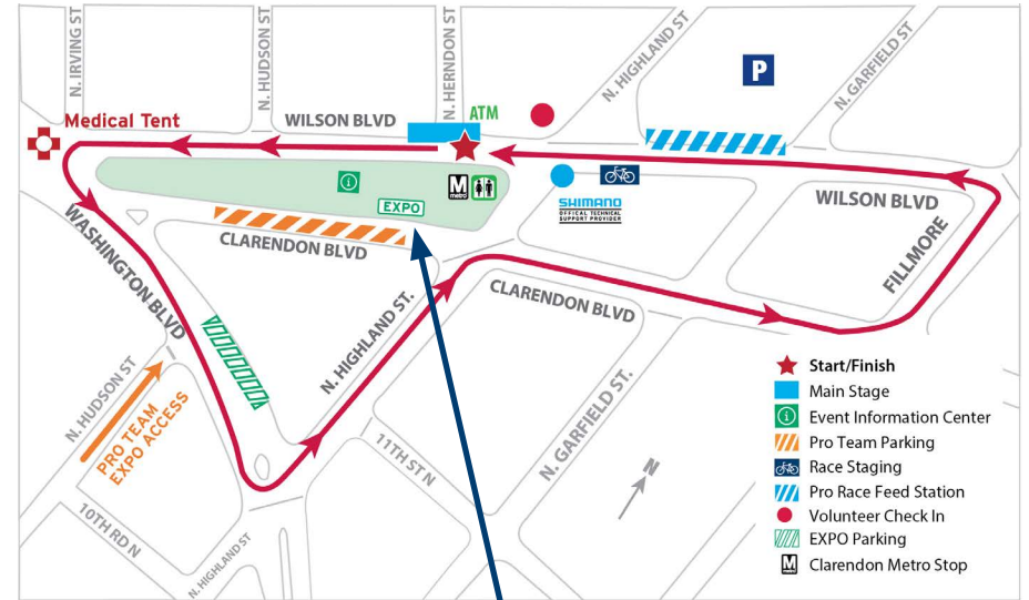
Sunday, June 2